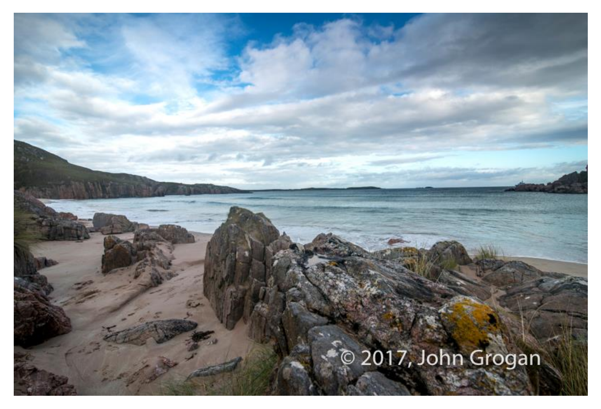
Durness